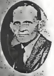
E. J. Jones Plumbing - Heating